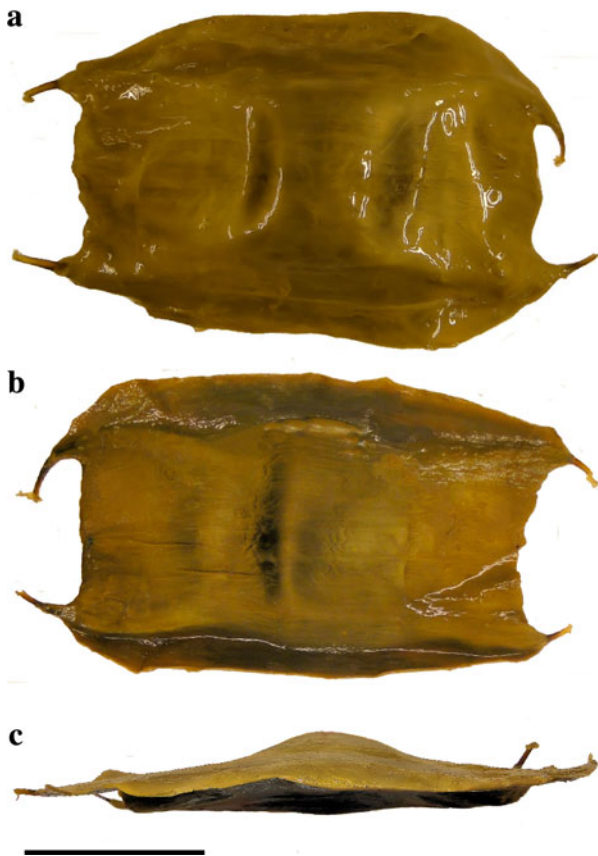
Fig. 3 Dorsal (a), ventral (b) and lateral (c) views of the egg capsules of Dipturus trachyderma . Scale bar 100 mm

Mean value (mean) and standard deviation (SD) are indicated for each measurement (in mm). Abbreviations of egg capsule measurements are indicated in Fig. 1